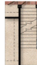
OPT. BASEMENT PLAN