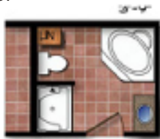
OPT. GLAMOUR BATH